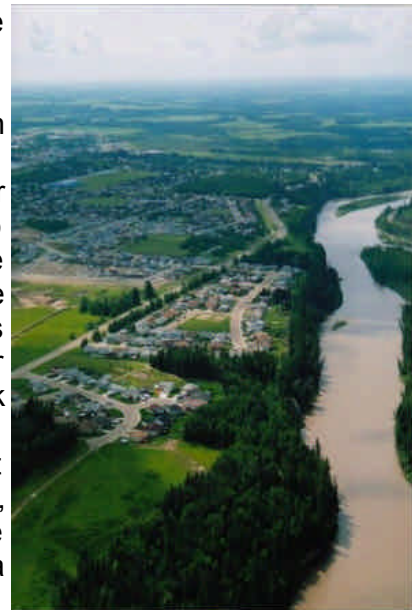
The town of Rocky Mountain House today.

So there it was. Not only had the Rocky Mountain Ogopogo itself never existed, but even its mythology was