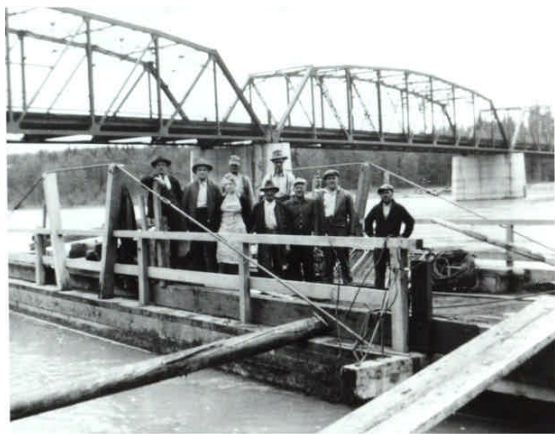
Ferry on North Saskatchewan River at Rocky Mountain House, 1946.